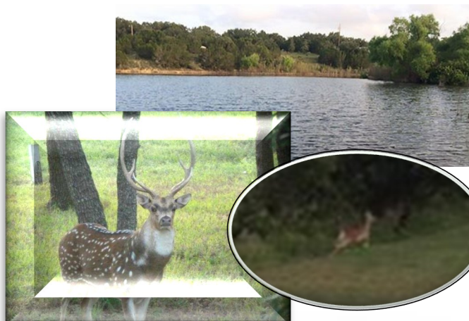
A neighborhood friendly to wildlife