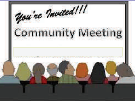
Highlights of the HOA Community Meeting